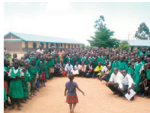
Fig 3: Volunteers with Mingoro Primary school pupils during a visit to the Reading Corner there.

Lastly, the savings and credit scheme promotes women's income-generation through small scale business management. The initial