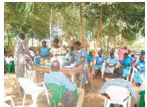
Fig. 2: URLCODA team giving out scholastic materials to needy girls, Aroi sub-county.