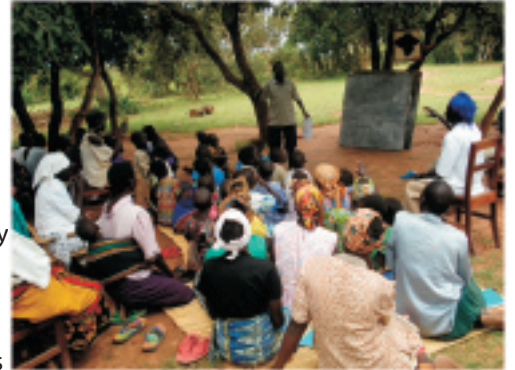
Fig. 1: A URLCODA intergenerational literacy class

Libraries have historically served as custodians of information and knowledge used for various purposes. Unfortunately, libraries tend to be better accessed and utilized by literate people, who constitute the minority of the rural population. The situation is further compounded by the fact that most libraries are located in urban areas not easily accessible to rural communities. This urban bias in terms of library location has not only alienated rural communities around their usage of information and access to knowledge; but also made the realization of their potential as alternative means of improving rural people's livelihoods very difficult. Even in rural areas, most schools lack libraries. Even for those with libraries, communities often remain detached from schools. Furthermore, the last few decades have witnessed a marked deterioration in reading culture among people of all ages. In Uganda, this is seen in the large percentage of pupils who complete primary school without attaining the desired reading and writing skills, even in their mother tongue. The introduction of universal primary education (UPE) which has tremendously stepped up pupil enrolment in schools has worsened an already bad situation, as standards, performance and quality seems to have deteriorated following the introduction of this policy. URLCODA volunteers believe that there is an urgent need to bring together parents, pupils, school managers/administrators, local leaders, government officials